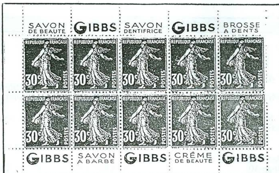
Sheet from a French booklet with ads in the margins.