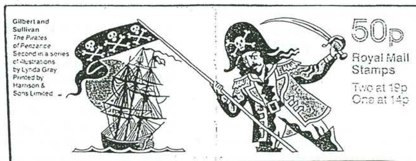
Modern English booklet (front and back). The illustrations have no connection with the stamps inside.